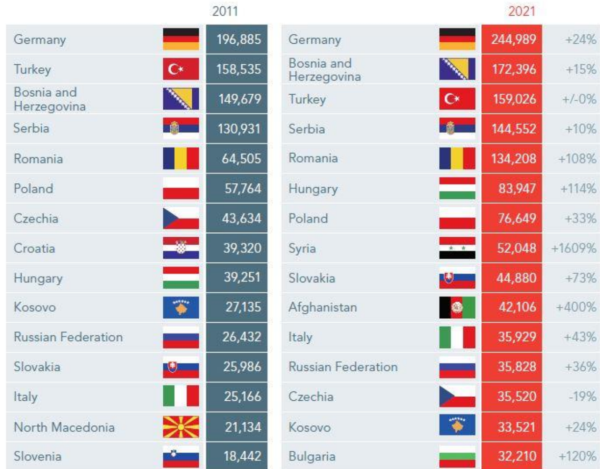
Fig. B.6; Source: Statistik Austria 2021, Bevölkerung zu Jahresbeginn 2002 – 2021 nach detailliertem Geburtsland; own illustration

2011 and 2021 by most common countries of birth, change in percent