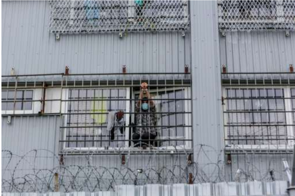
Photo 1. Kybartai Foreigners' Reception Centre.

The material conditions are significantly smaller than the minimum living space per person; there is a lack of private space and hygiene; and strict restrictions on movement are applied (11.1-11.4). In addition, the right of foreigners to be informed about their rights and obligations, the decisions made against them, and access to legal aid is not adequately guaranteed; therefore, foreigners are often in ignorance (11.6). The report also points out the circumstances related to the availability of personal health care services access to health care is not adequately ensured (11.8). In addition, the vulnerability and special needs of migrants and asylum seekers are not properly assessed (11.9). Finally, it is stated that officials of Kybartai FRC carry out multiple night-time alerts and use psychological pressure on aliens to return to their countries of origin as soon as possible (11.10).