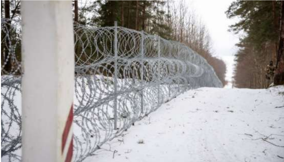
Photo 3. Temporary barbed wire fence on the Latvian–Belarussian border in winter 2021-2022.

Latvia’s border with Belarus will be further reinforced by a 137-kilometres-long and more than three metres high permanent fence, the construction of which will start in summer 2022. The first segment to be built is 84 kilometres-long and worth 53.5 million euro. According to preliminary estimates, construction of the whole fence will require more than 100 million euros. 92 The permanent fence is part of the new infrastructure along the entire Latvian–Belarussian border (173 kilometres) to be developed by 2024. The government has so far earmarked 44.2 million euros for infrastructure construction on Latvia’s Eastern border with Belarus and Russia in the period from 2021–2024. 93