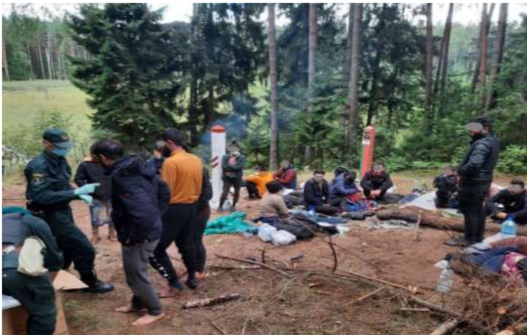
Photo 2. People stranded at the border.

The deterrence or pushbacks of irregular border-crossers started on the very day the emergency situation was introduced, on 10 August 2021. 76 Unable to re-enter the Belarussian territory due to the measures taken by the Belarussian forces, border crossers remained literally stranded at the border 8 . After 56 persons were deterred from border crossing on 11 August 2021 and 101 persons the next day, around 100 people, divided into several groups, stayed in the area between the border posts, initially without any food or water. 77